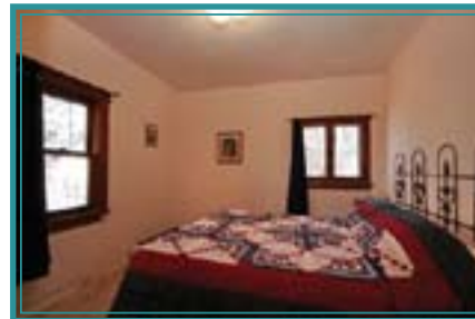
Carriage House Guest Room