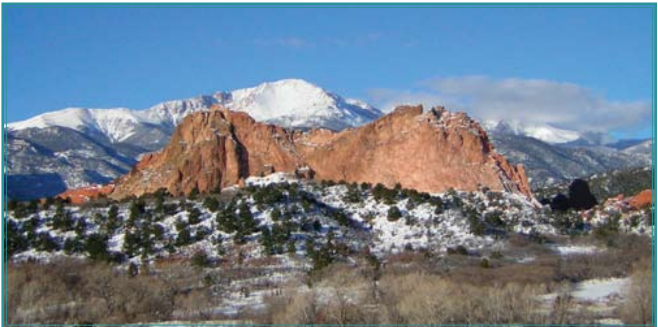
Pikes Peak and Garden of the Gods

In Manitou Springs, you can truly get away and relax, or you can be as busy as you want to be. That’s the spirit.