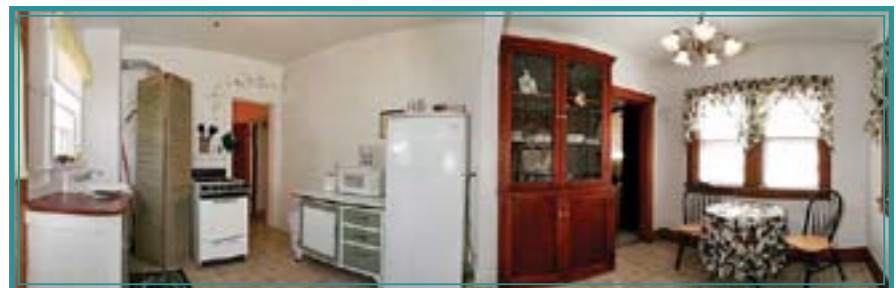
Carriage House Kitchen/Dining Room