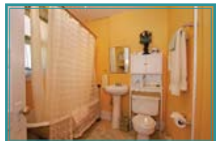
Carriage House Bath